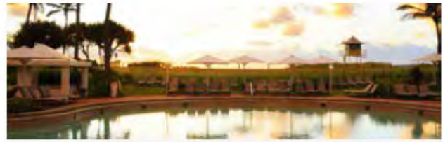
Large-scale Recreational Infrastructure in a Landmark Location