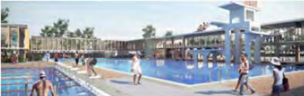
Specially Constructed Diving Facilities