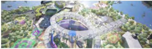
GC 2018 Commonwealth Game Infrastructure